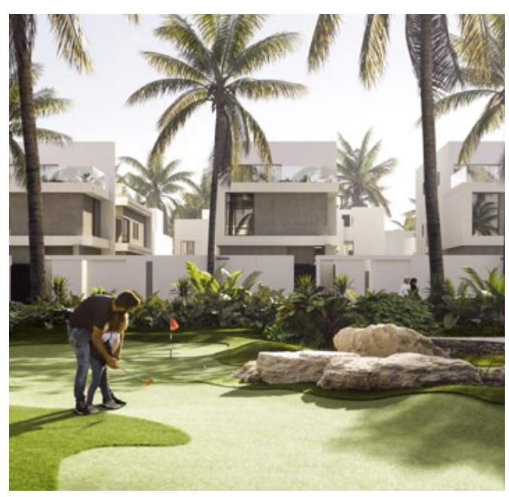
Retal launched Ewan Tharwa, a 386-villa project in Khobar